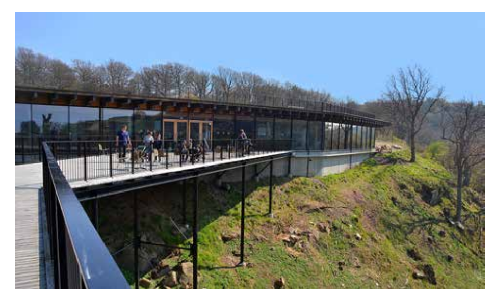
The Visitor Center and bridge towards ruins and the castel