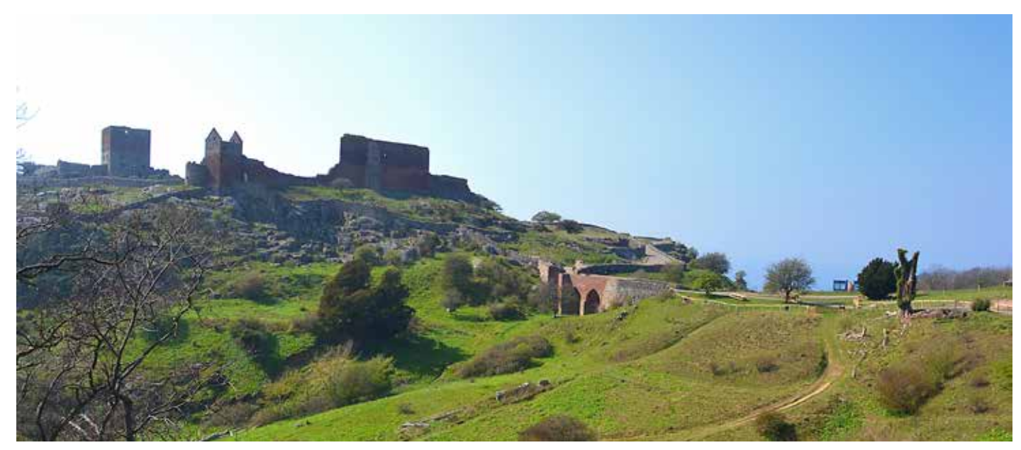
The Hammershus Castle Ruins