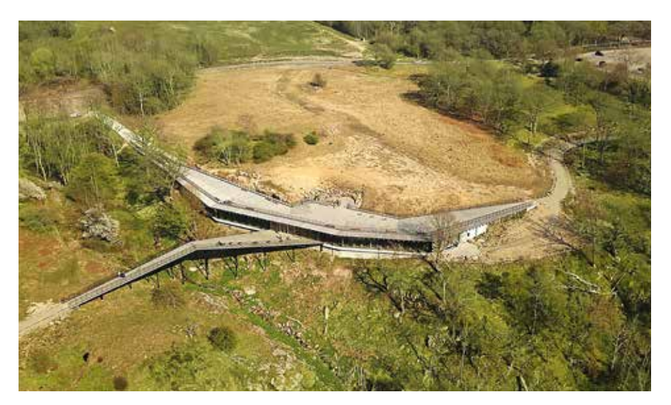
Top view of the Hammershus Visitor Center

The Hammershus fortress was fought over by various Danish and Swedish kings and changed hands several times throughout its storied history. For the first 500 years of its life, Hammershus served as the