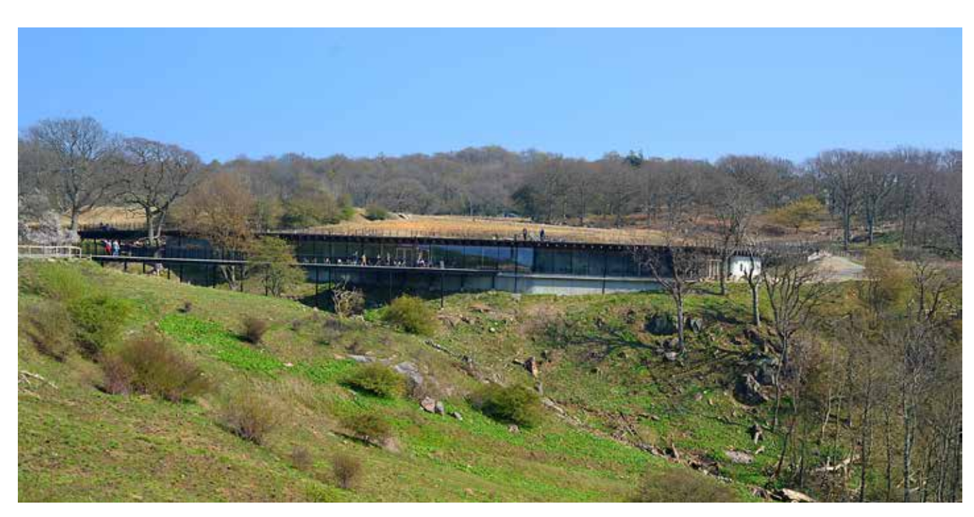
View of the Visitor Center from the side of the castle

of the surrounding path system, rather than a disturbing element in the landscape. In other words, we offer visitors an added opportunity that wouldn't have been available to them if they simply walked into a conventional visitor center. We felt that it was important to create a dynamic landscape route, where visitors have plenty of opportunities to experience the natural surroundings and the historical ruin", explained Poul Schülein, Senior Partner at project architects Arkitema.