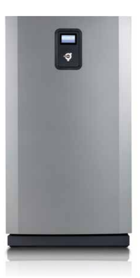
Thermia Mega XL heat pump

and cooling system is based on Thermia Mega XL (21-88 kW), a new commercial ground-source heat pump with an inverter-driven