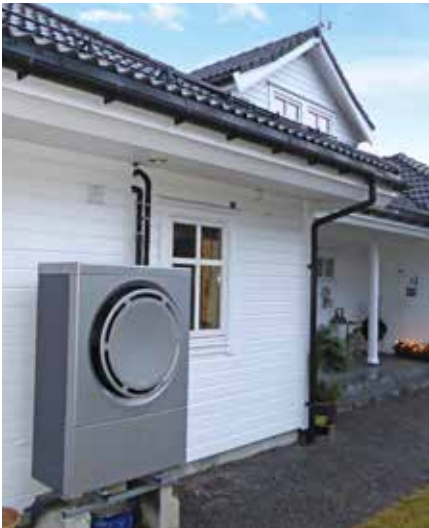
Thermia Atec air source heat pump