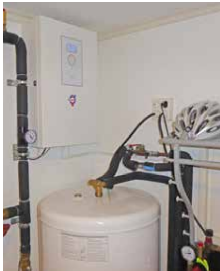
Indoor unit with control system

Sande did all the plumbing in the house and took care of all the technical issues.” Tormod Heldal is delighted with both the Thermia heat pump and TPA Plumbing Service: “The Atec heat pump is significantly better than the old heat pump. After the first winter of operation, our energy consumption halved and, most importantly, it is significantly quieter than the heat pump we installed when the house was built.”