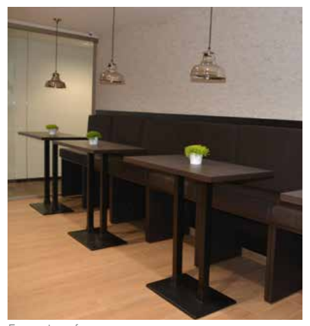
Foyer at conference rooms

MicroStep decided to build their new office in Bad Wörishofen. The most important investor requirement was: maximum savings using renewable energy and maximum efficiency in heating and cooling the building. When choosing materials for the build the aim was to reduce heat loss as much as possible. It was clearly stated from the beginning that the heat source must be in accordance with the quality of the materials used for construction, moreover the heating system supplier must have extensive experience in