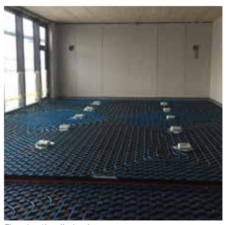
Floor heating (indoor)

'Already the first season has proved that investing in a Thermia air source heat pump has paid off, along with its perfect functioning and totally reliable operating conditions, it also has exceptionally low energy consumption.' – says Ondřej Kučera, business development manager at IVAR CS