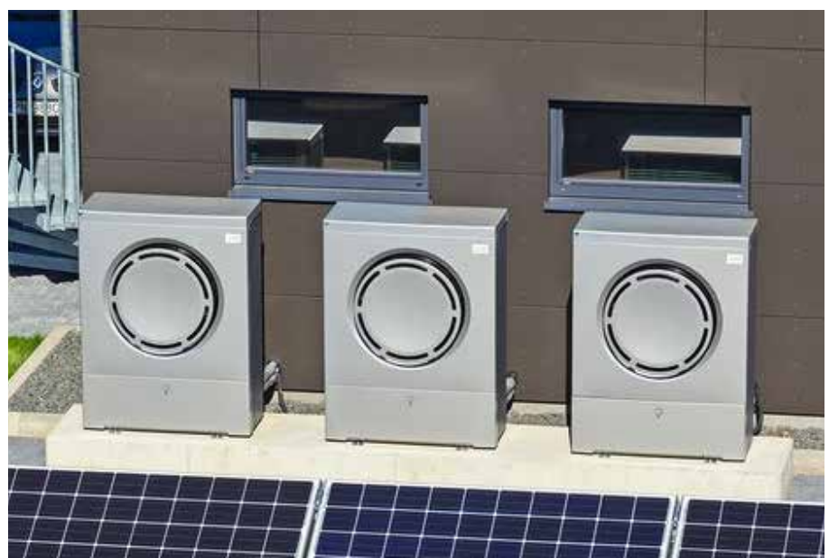
hermia Atec air source heat pumps (outdoor)

It is worth underlining that besides heating, Thermia Atec provides cooling in the summer when the