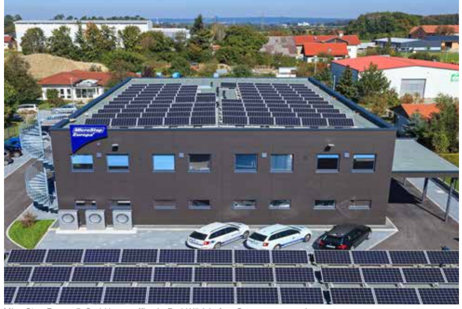
icroStep Europa® GmbH new office in Bad Wörishofen, Germany – rear view